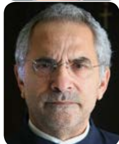
Dr José Ramos-Horta AC Nobel Peace Prize Laureate