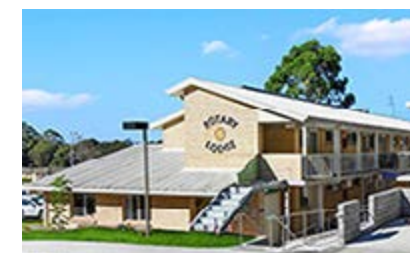
Rotary Lodge Port Macquarie http://www.rotarylodge.com.au/