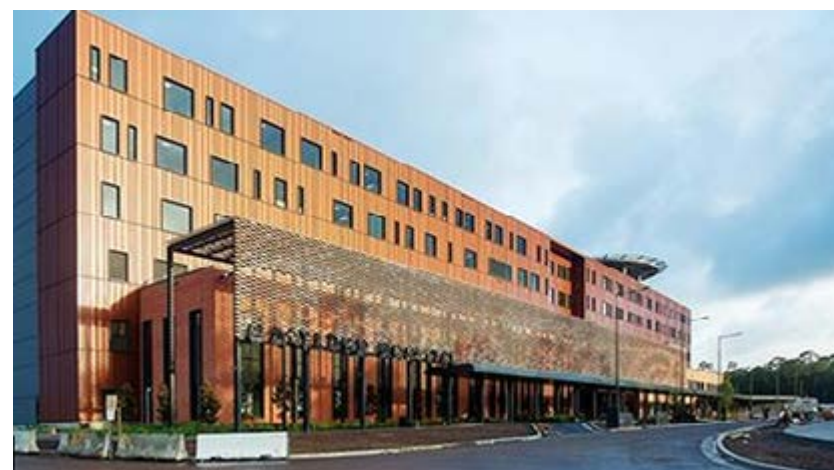
Above: The New Maitland Hospital http://newmaitlandhospital.health.nsw.gov.au/

PP Rotary Club of East Maitland Director Maitland HealthStays Limited