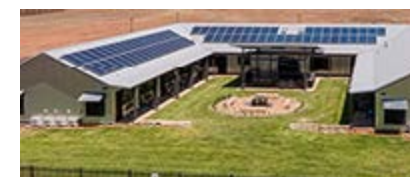
Macquarie Home Stay Dubbo https://www.macquariehomestay.com.au