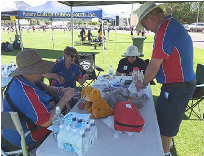
Rotarians sorting medals for presentation supervised by Nifty and Isda

DreamCricket began in 2008 when physiologists from the Movement Disorder Foundation collaborated with cricket coaches from the Bradman Foundation in Bowral and Rotary Clubs of Southern Highlands to provide a sporting opportunity for upper primary students with special needs.