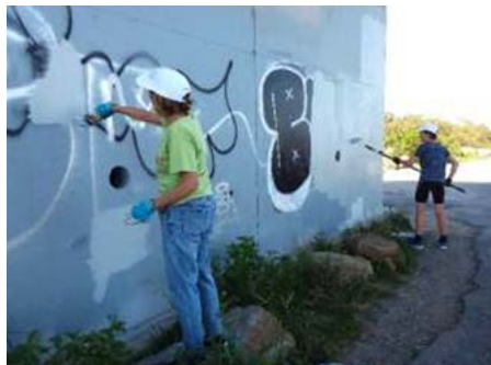
Newcastle Enterprise RC Volunteers