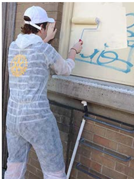
Young Rotarian in action – Belmont