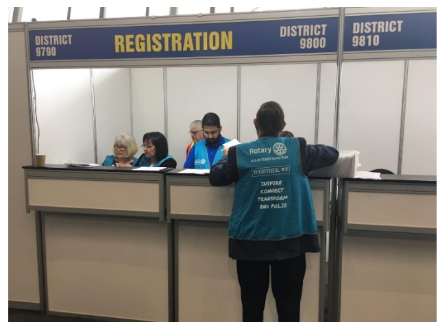
4 DISTRICTS AT MCEC AND OUR FAMILY OF ROTARY TOGETHER FOR CONFERENCE 2019