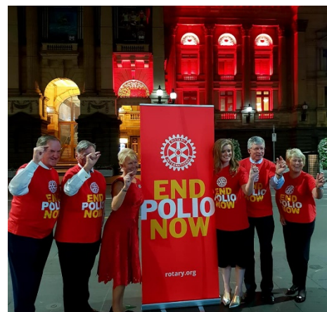
LIGHTING UP THE MELBOURNE TOWN HALL FOR END POLIO