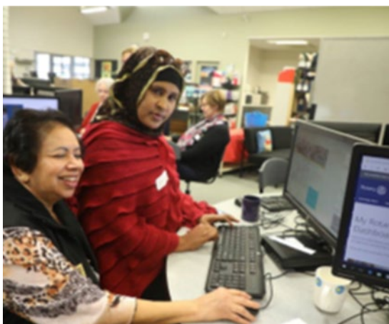
ROTARY.ORG WORKSHOP – WHAT FUN