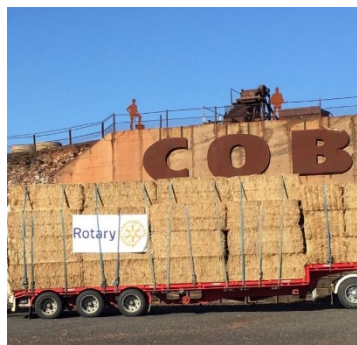
RC CASTLEMAINE & EAGLEHAWK COMBINED TO ASSIST COBAR

The D9800 drought relief project has been successful in achieving its aims of supporting drought affected communities whilst at the same time building connections between D9800 Rotary clubs and Rotary clubs in affected communities.