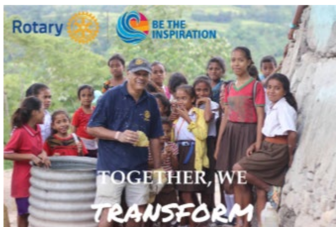
CLEAN WATER, EDUCATION AND MORE IN EAST TIMOR