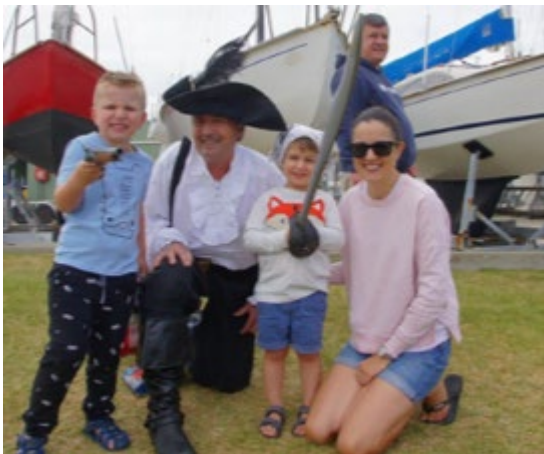
RC POINT GELLIBRAND CHALLENGE KIDS PIRATE DAY