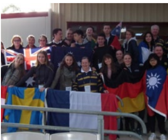
YOUTH EXCHANGE 2017-2018