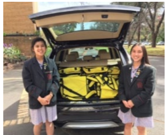
MACROB INTERACT COLLECTING FOR EAST TIMOR