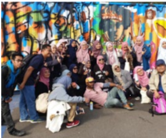
DOCKLANDS SHIPPING CONTAINER DESTINATION MALAWI