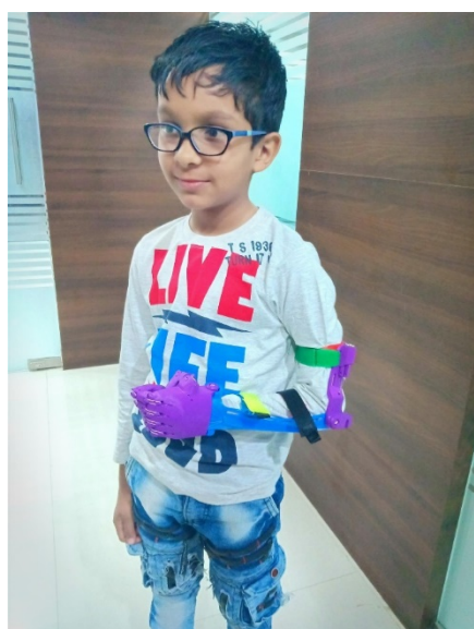
AN INDIAN CHILD THE RECIPIENT OF A PROSTHETIC HAND COURTESY OF RECYCLED PLASTIC BOTTLE TOPS, ENVISION AND LOTS OF ROTARIANS