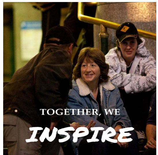
STEPS OUTREACH ADDRESSING HOMELESSNESS