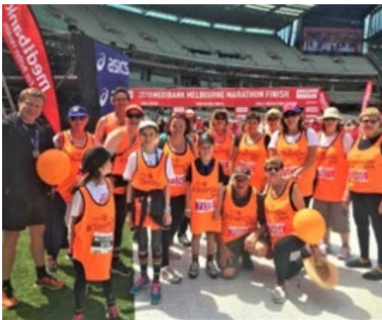
RUN FOR DEL TEAM RAISING FUNDS FOR ROTARY HOUSE