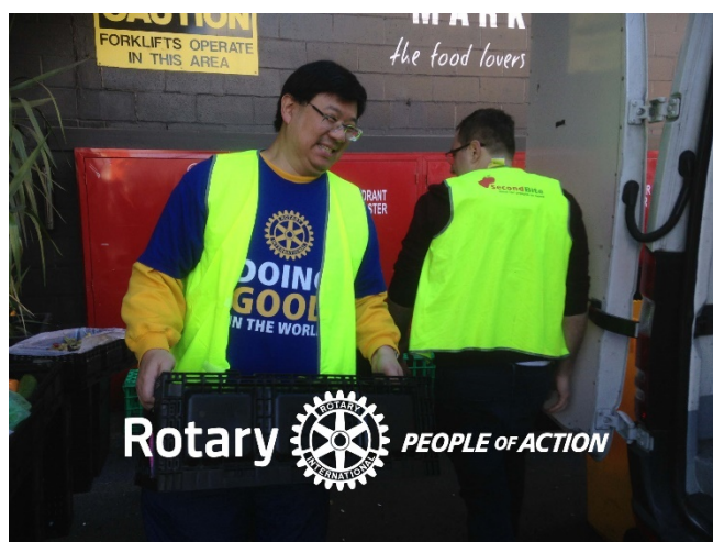
E CLUB COLLECTING FOR SECOND BITE