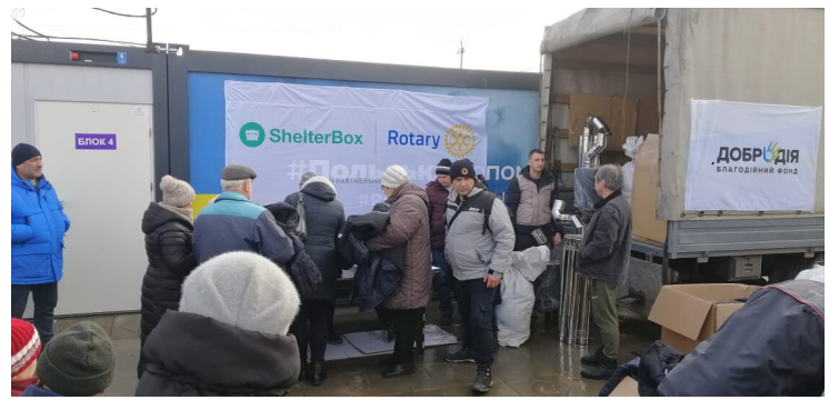
Distributions in Novoselivka, Ukraine in February.

On 24 Feb 2022, Russia launched a major military operation in Ukraine, representing a significant escalation of the conflict which has been ongoing in the east of the country since 2014.