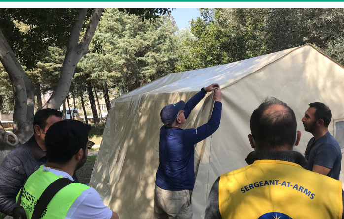
In partnership with Rotary and the local municipality, the ShelterBox team have been leading 'train the trainer' sessions, sharing knowledge and best practice on tent setup.

Rotary is supporting the Government led response, coordinated through AFAD, supported by the Turkish Red Crescent (TRC). Rotary is working closely with, and have permission from, AFAD to operate in some of the affected areas. Rotary's connections with AFAD, search and rescue organisations, supply chain and logistics businesses and municipalities has been critical in