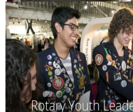
Rotary Youth Leader