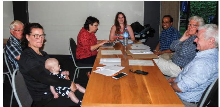
The Directors' meeting which immediately followed the Forum

This week was a club forum which gave members the opportunity to discuss the items that the Board had suggested to vary some of our usual evening meeting structure and to explore the possibility of a community focused project. Members discussed these topics in their service committee groups and subsequent feedback showed a diverse range of thoughts. A summary of the feedback provided from that discussion will be sent separately to Club members. Committees also got the opportunity to review the earlier goals they set and see if they were on track and there was the opportunity to reevaluate direction for the coming months.