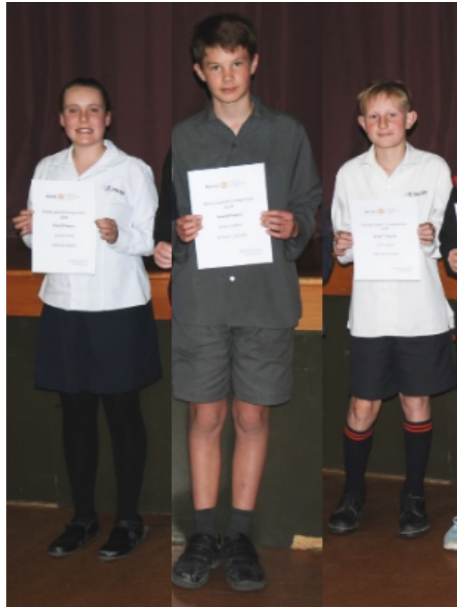
Year 7 & 8 speech competition winners and runner up from year 8 present their speech at the Rotary Club of Christchurch South

The composure and confidence of the speakers were incredible when you consider these speakers are between 11-13 years old. The students represented the exact reason why as a club we continue to put the effort in to make sure the speech competition is one of the club's yearly events.