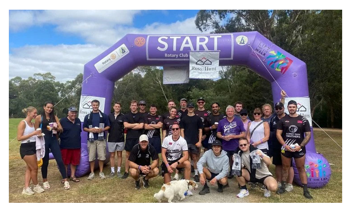
A huge congratulations Rotary Club of Mont Albert and Surrey Hills on successfully hosting their fourth Lift the Lid Walk.

Read more in our online publications and newsletters