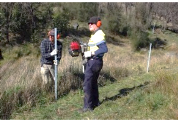
Using a dropper knocker to drive in a steel post on a fence, with the creek line behind at the bottom of the valley.