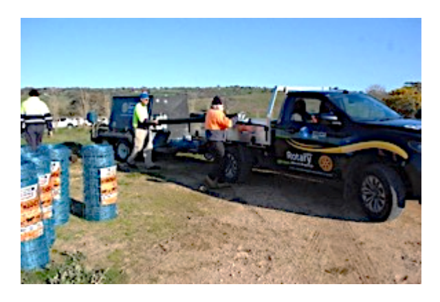
RAWCS funded utility in the field

We are lucky that Landscape SA and property owners are funding most of the work, but every job has an element of Rotary support through the RAWCS Bushfire Recovery Fund. This provided funds to help purchase our tractor and utility.