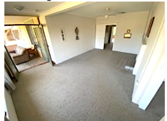
Bushview pre work

In late August a team from Regency Park, Walkerville and Edwardstown returned to replace the flooring in Bushview.