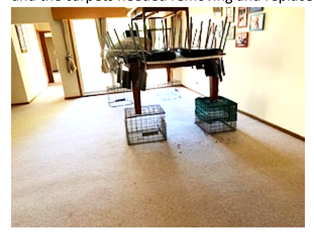
Rotary House Pre-Work

In January/February earlier this year with the potential of flooding in the Renmark area, all the furniture was removed from Rotary House, Bushview (was House 4) and the two Dorm blocks to protect them. Once removed it became obvious that the walls and ceiling needed painting and the carpets needed removing and replaced with floating floors.