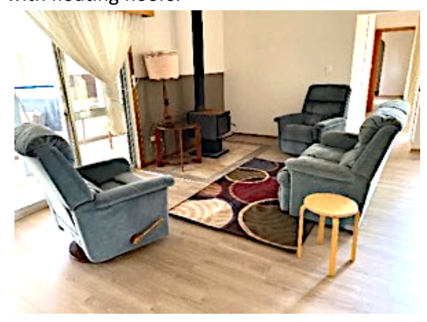
Rotary House Post-Work