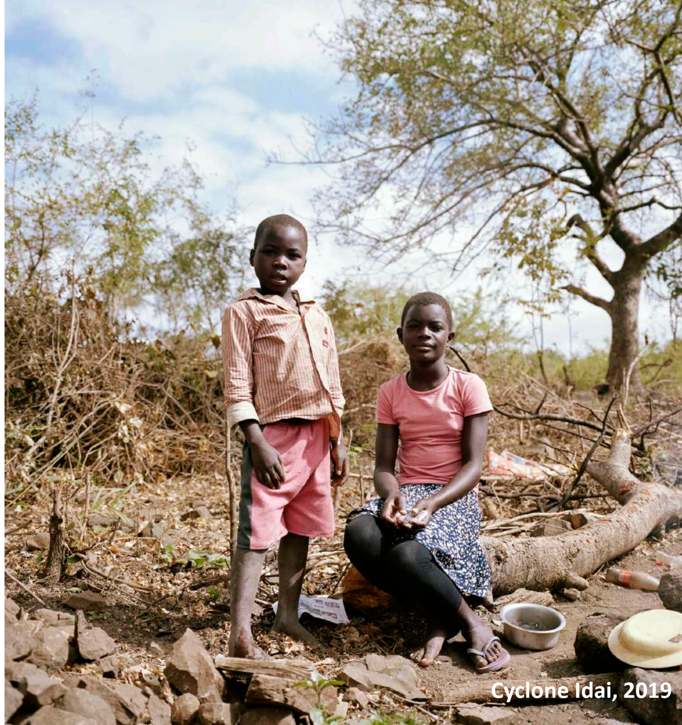
Cyclone Idai, 2019

Statistics share the magnitude of our impact, but stories from people you've helped shelter, bring our mission home.