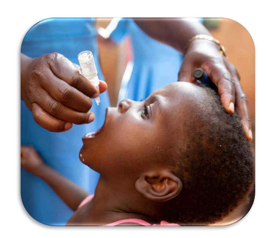
Immunizing more than 400 MILLION CHILDREN every year