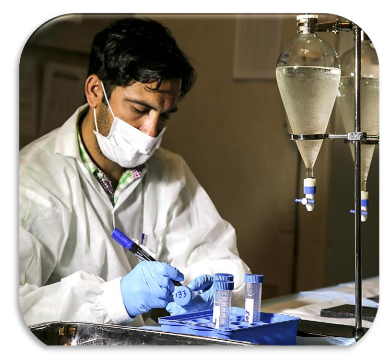
Continuing DISEASE SURVEILLANCE ACTIVITIES