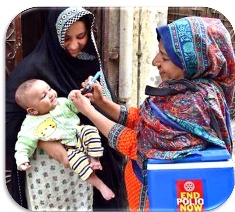
Funding more than 150,000 POLIO- WORKERS annually