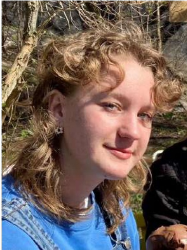
Svea D2400 Sweden