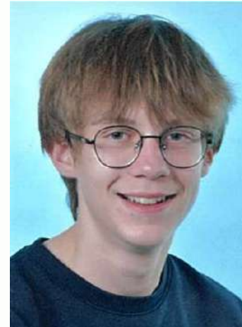
Simon D1890 Germany Pt Augusta