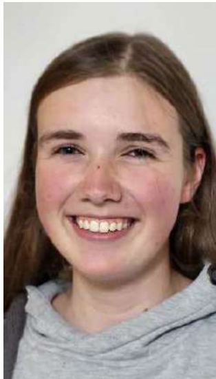
Malin D1890 Germany Pt Lincoln