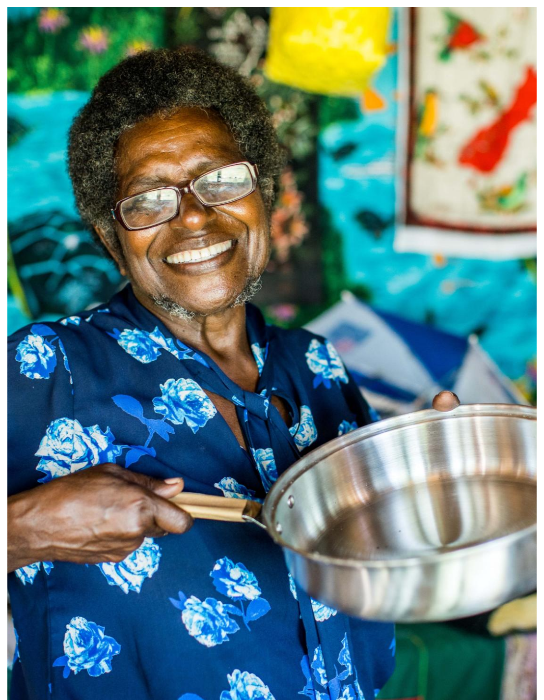
Photo opposite: Rise with cooking equipment, Vanuatu, 2020 after Cyclone Harold.

We don't believe that one size fits all, so we spend time talking to affected families to make sure we provide the right support at the right time.