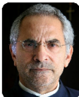
Dr José Ramos-Horta AC Nobel Peace Prize Laureate