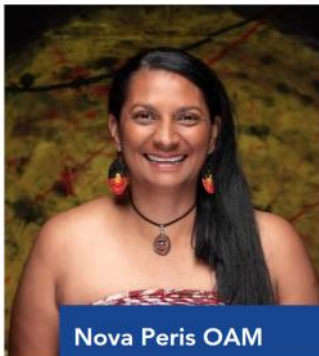
Nova Peris OAM Former Senator / Dual Olympian