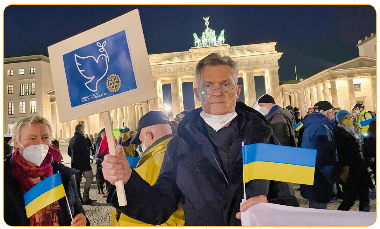
Immediate Past RI President Holger Knaack leading a protest for peace in Berlin

Those wanting to make a donation can google Rotary Foundation Australia and click on the Ukraine link on the homepage. Donations are tax deductible. https://my.rotary.org/en/disaster-response-fund