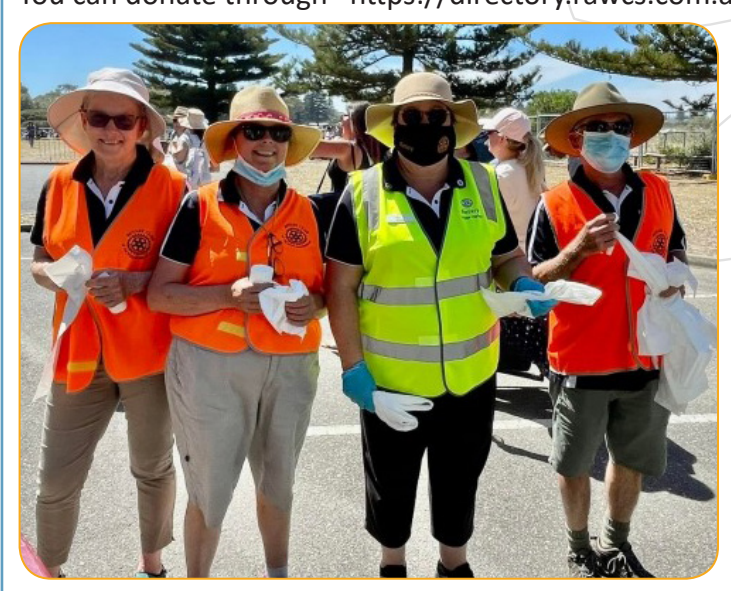
Members of the club getting gloved up to start their shift

You can donate through https://directory.rawcs.com.au/47-2021-22