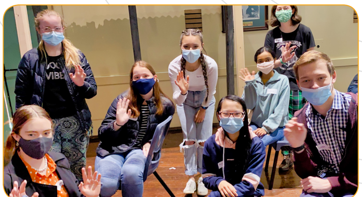
Orientation: some 2022 NYSFers chatting with masks on