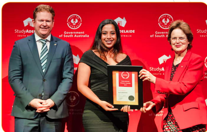
Her Excellency the Honourable Frances Adamson AC presenting the award with the Chair of Study Adelaide