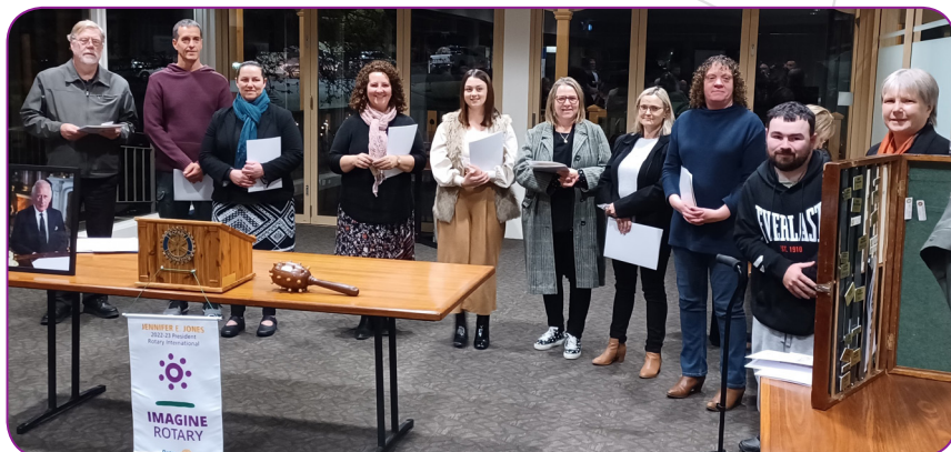
10 members were inducted, several others committed to join

So, on Wednesday the 14th September 2022, at meeting #3240 for the 64-year-old RC Loxton, the brand-new Loxton Rotary Satellite Club was born.