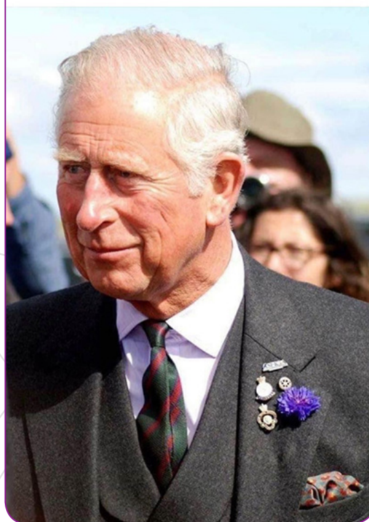
King Charles III wearing his Rotary pin!

However we are both proud and encouraged that we have yet another Rotarian committed to Service above Self.