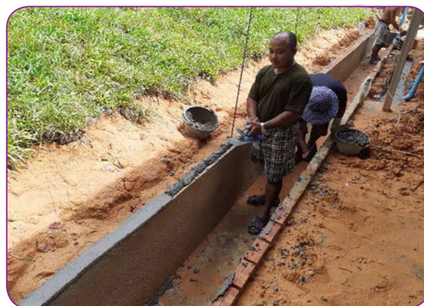
52 metres of concrete drainage channels