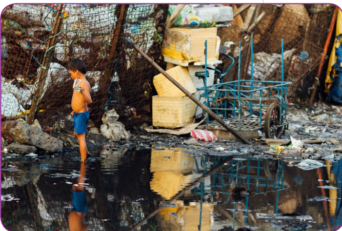
Child living at the Tondo garbage dump Manila

In addition, a community eco-store will be set up championing zero-waste retailing through bulk purchasing and bring-your-own-container initiatives. With partner Grameen Pilipinas Microfinance Inc, the project will facilitate microloans and entrepreneurship training for aspiring microentrepreneurs to start their own businesses. Partnership with the Rotary Club of Manila will give access to mentoring opportunities to help business owners succeed.