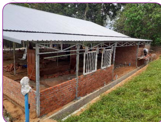
Brickwork Kitchen & Bathrooms