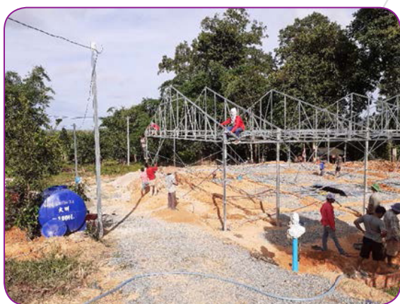
Erecting frames and trusses