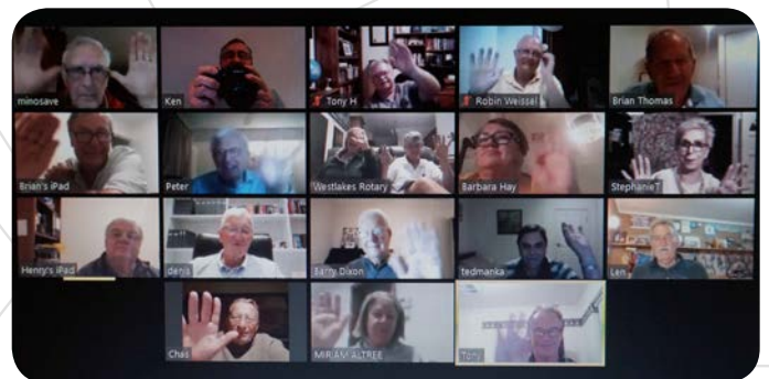
West Lakes members enjoying a ZOOM meeting

All members have joined in the meeting format and we regularly enjoy 80+% attendance. RCWL has found new community and international projects at this time - assisting to contact isolated and “at risk” people through wellness packages, keeping up help with Meals on Wheels, and extending our international contacts by sending greetings to Clubs we toast weekly, sometimes enjoying a reply!