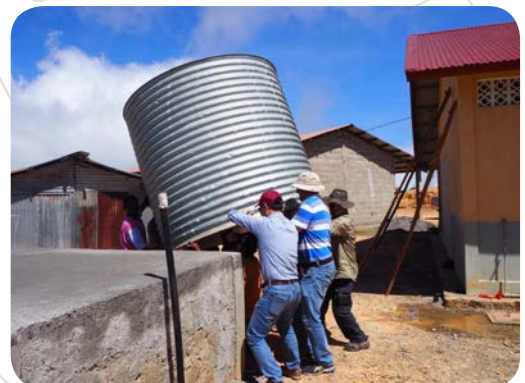
Stirling Water and Sanitation project in Timor Leste