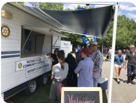
Stirling Catering Van