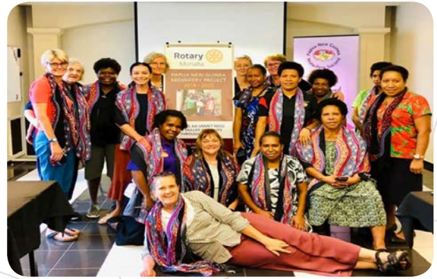
RC Morialta in Adelaide - PNG Midwifery Leadership Buddy Project

Our international project is supporting midwives in PNG. When midwife members of the Papua New Guinea Midwives Society (PNGMS), reached out to the Australian College of Midwives, to develop leadership and advocacy training to address the urgent need to improve maternal and newborn outcomes in PNG, members saw their opportunity to assist. In 2017, with the assistance of Rotary Foundation grants, the club developed a 3-year project, to provide 18 midwives in PNG with a leadership and advocacy 'buddy' program. We are looking to continue this project with further support from clubs in the district.