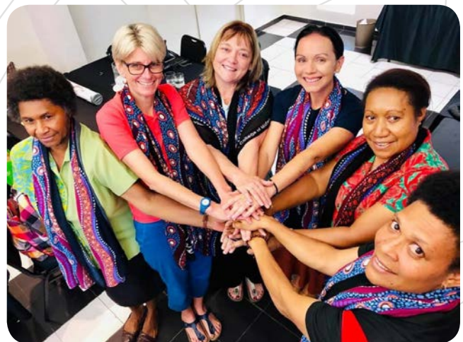
This project is the joint district 9520 winner of the best Rotary International Project for 2020.