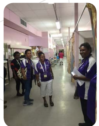
PNG Midwives working in a Port Moresby Hospital.