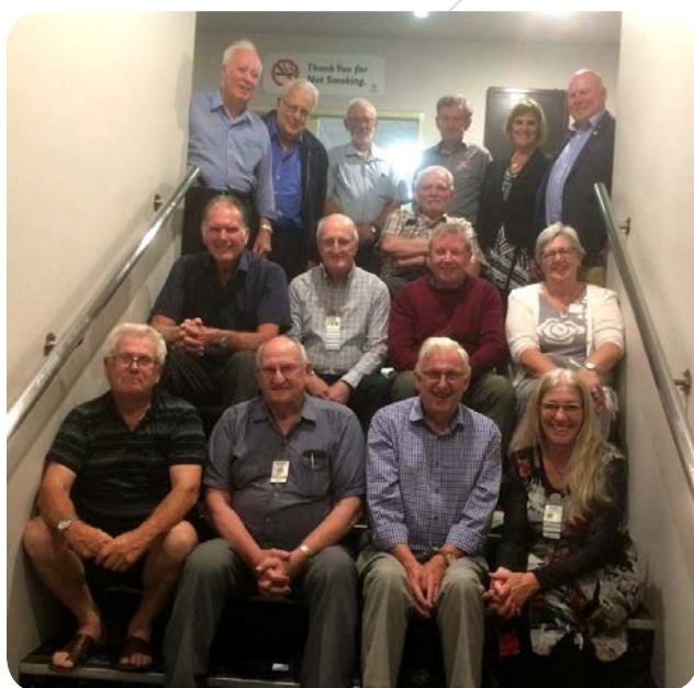
West Torrens members group photo

A 16-member Nazareth Outreach Team travels annually to Baucau to support a local NGO in health, education and community building activities. Each year, a shipping container full of furniture, medical equipment, clothing and computers is sent to support local community projects including the construction of three community playgrounds, a Maternity Clinic, water filters, vehicles for mobile health services and computer training. This project has benefitted from the support of the District Grants program, DIK and the RAWCS office in Dili.