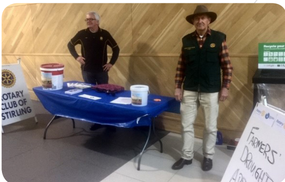
Farmers Drought promotion day