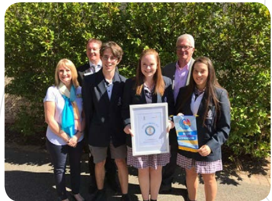
Stirling Charter to Interact Club