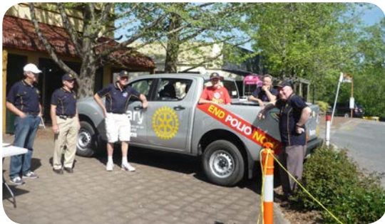
End Polio promotion day

The Club's current major project is organizing the region's first ever Small Acreage Field Days to bring together local industry and small acreage land holders over the weekend of 13, 14 March 2021.