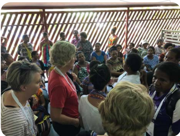
Clinical Immersion day in Pt Moresby where Midwives from Australia and PNG visit workplaces and health care facilities.