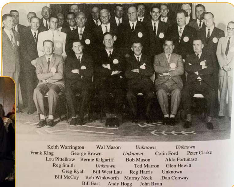
Alice Springs Charter Meeting