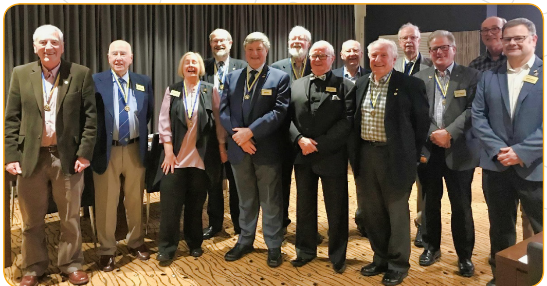
Past Presidents and Paul Harris Fellows Rotary Club of Unley