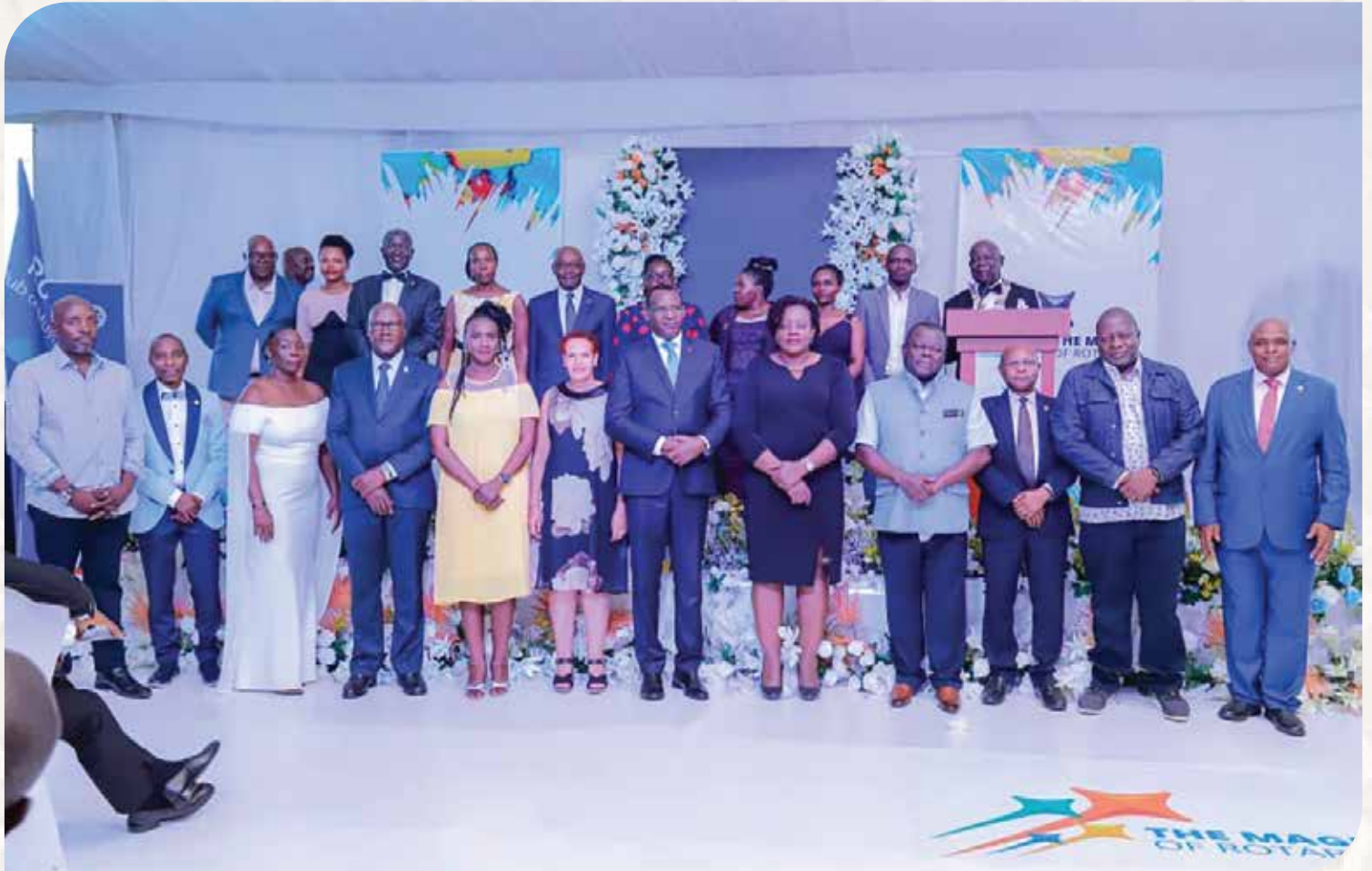
RCM Board 2024/25