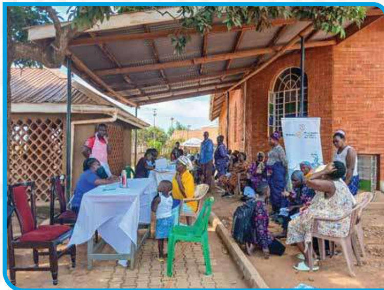
Health Services provided at Kibumbiro Medical Camp by Mengo Hospital

The Kibumbiro camp was a collaborative effort with stakeholders such as the leadership of St. Luke Church of Uganda, Mengo Hospital, Rubaga Hospital, local schools, Kampala City Council Authority, local leadership, and the community.