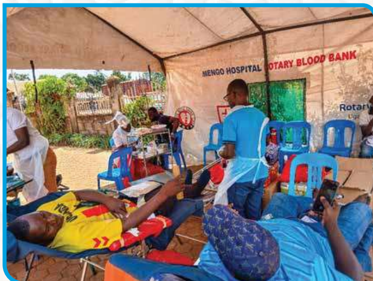
Blood donation at Kibumbiro Medical Camp supported by Mengo Blood Bank

The free health services included: Blood donation; Diabetes testing; Hypertension testing; HIV testing and Counseling and General treatment.