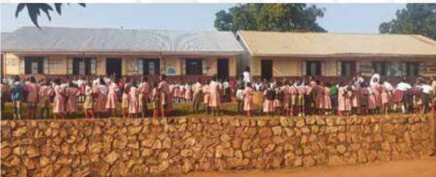
A new roof that was installed on the classroom block.