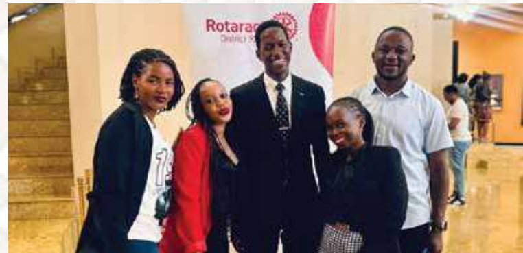
RAC Mutundwe members at the launch of the Rotary year 2024-25 at Speke Resort Munyonyo

Talking of club social events, members of RAC Mutundwe members sure know how to turn up. The song goes "If you send me the location, then I'll be right there.", and the Club has surely shown up. Here's an insight of some events attended.