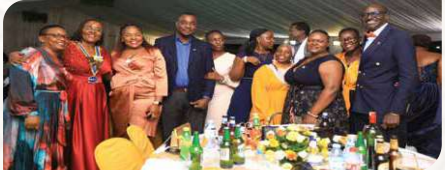
Photo moment of President Rhona with some of the guests that graced and witnessed the transition of leadership