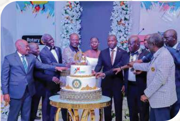
Cake moment to crown the function.