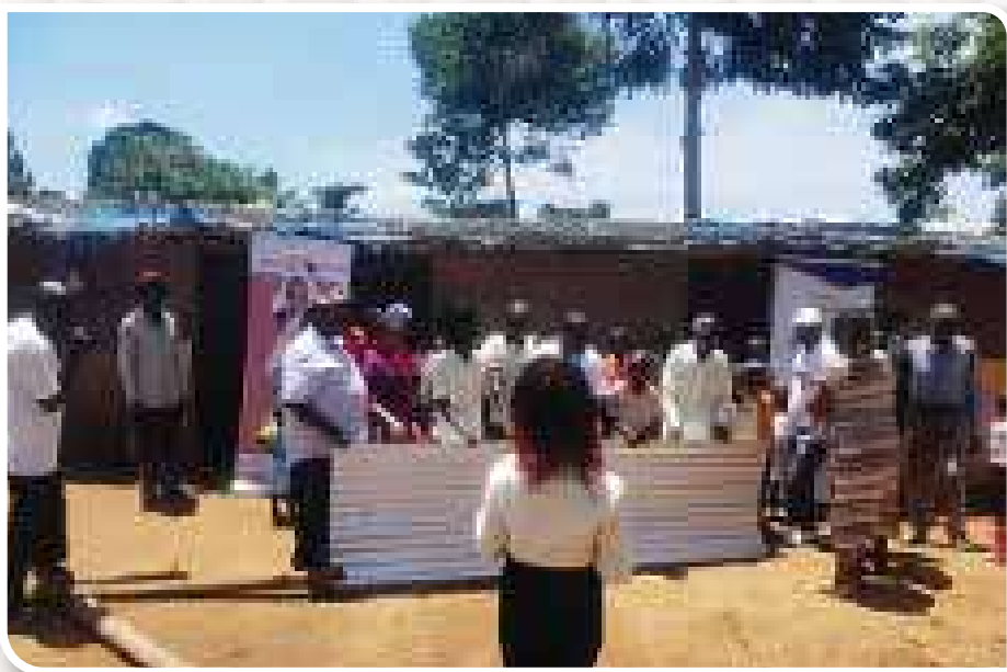
Donating Iron sheets to St. Agnes PS in Katebo