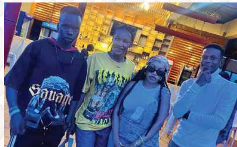
RAC Mutundwe members at the RAC Victoria University fundraiser themed old skool

With all that said, we wish you an amazing run in this Magical Rotary Year.