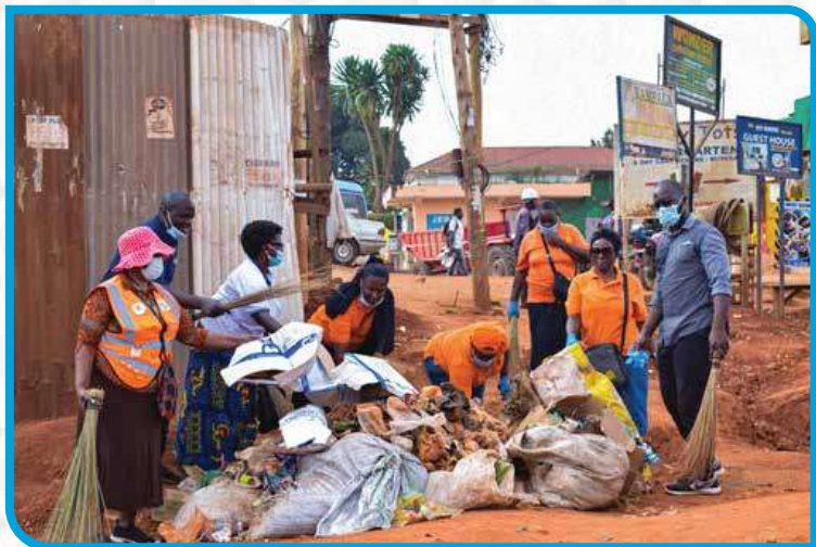
Community Cleaning Exercise in Kibumbiro by RC Lungujja