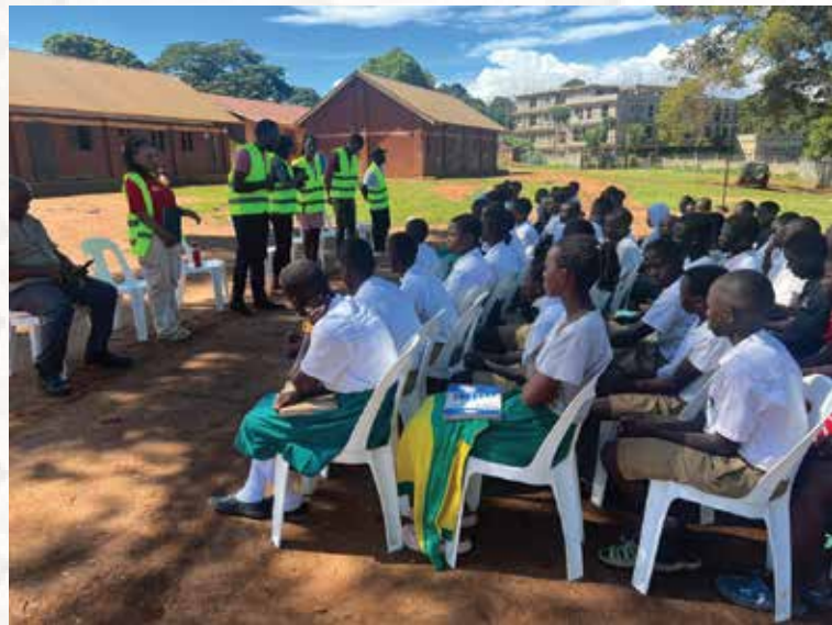
An Inspirational talk to the P.L.E candidates of Busaabala Primary School

On the 4th of November, 2023, the Rotaract Club of Mutundwe, while still in formation, visited Busaabala Primary School, aiming to address the area of Basic Education and Literacy. Rotaractors had the opportunity to interact with and inspire the pupils of this school by providing them with scholastic materials as well as providing meals to the PLE candidates as they sat for their final exams. The Project was a massive success and the Club was glad to have created hope.