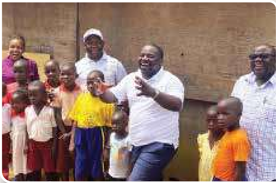
Our CP, HCP and Magic President in one Photo