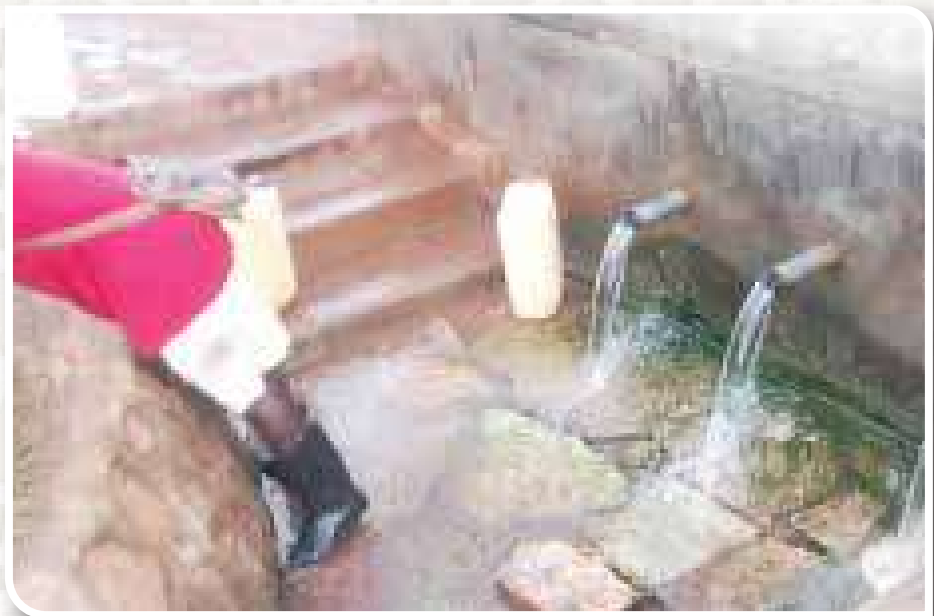
The water well-constructed in partnership with Clubs along Masaka Road corridor.