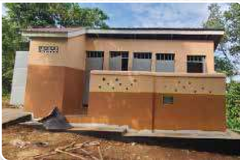
The finished Girls' Latrine at Ssekaza PS