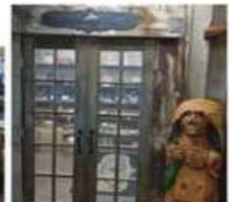
Lounge and Humidor, Casper Cigar Company