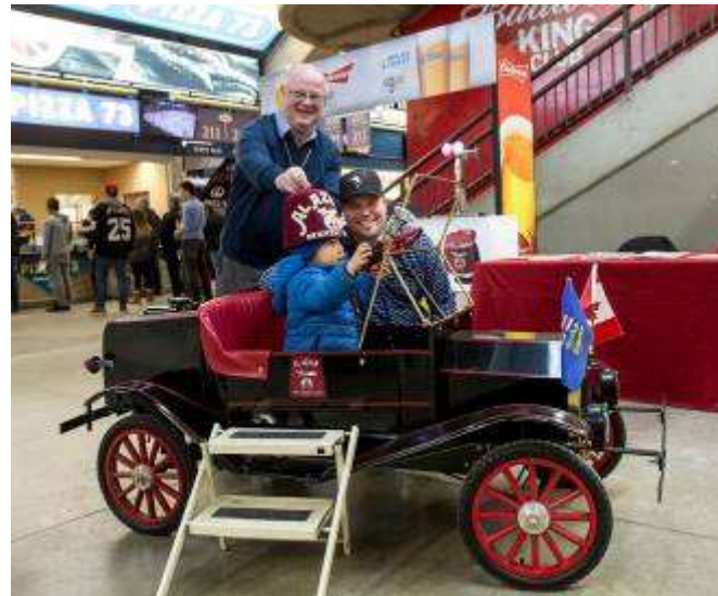
A future Shriner