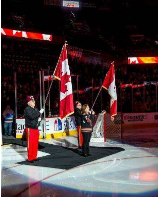
The Patrol flag-bearers for the national anthem