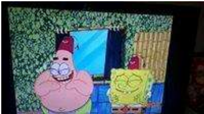
Sponge Bob has been fezzed!