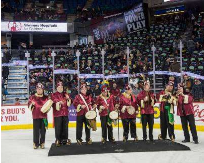
The GREATEST BAND in the world performing