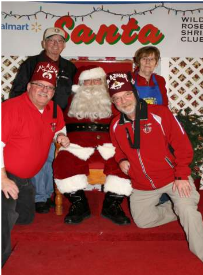
Wildrose SC members with the Kiwanis members and Santa