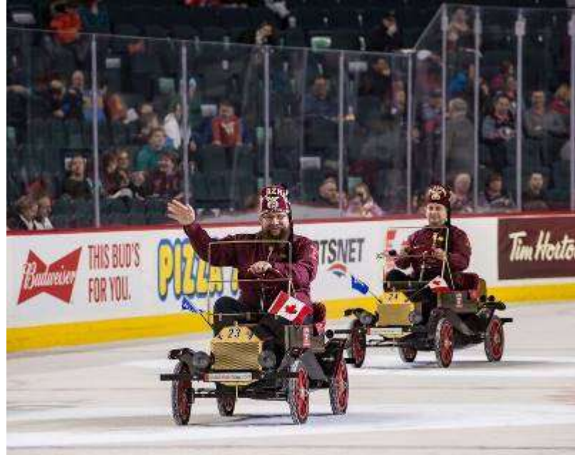
Crazy ice drivers!