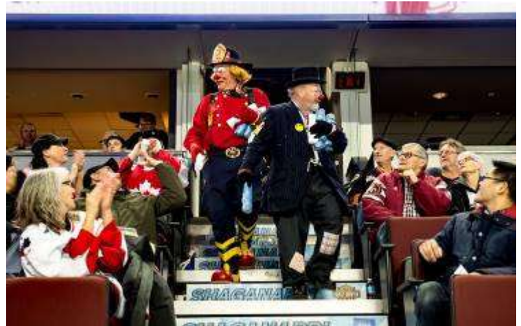
Some clowning around in the Saddledome