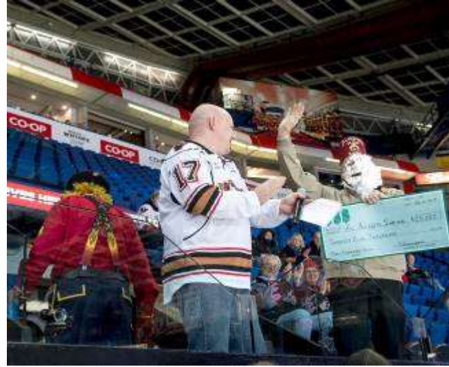
Somebody gets "creamed"