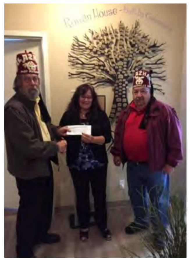
FHSC Cheque Presentation to Rowan House