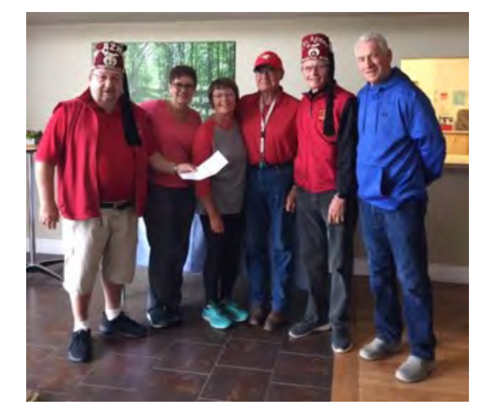
FHSC Cheque Presentation to Okotoks School Lunch Program