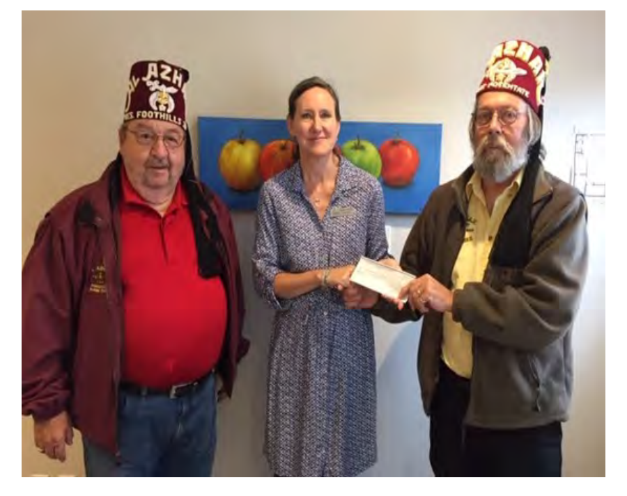
FHSC Cheque Presentation for the High River Food Bank