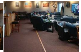
Lounge and Humidor, Casper Cigar Company

*EVENT REGISTRATION FEES ARE NON-REFUNDABLE*