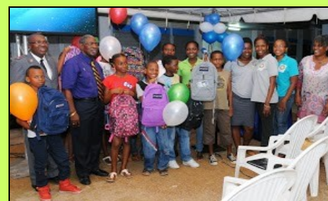
Members of RCPC, Rotaract Club Genesis and the kids from Huize Ramoth

This project was on a meeting day of the Rotary and during this meeting the Secretary of the Rotaract and Interact gave a speech about the function of the clubs. At the end of the meeting we handed over the schoolbags to the children with the President of the Rotary. Very important people were invited like the head of Ramoth and the board of Leger des Heils (a religious organization).