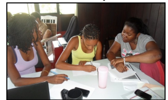
Members working on their manual