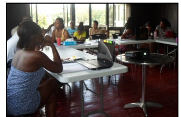
Discussions of the different avenues