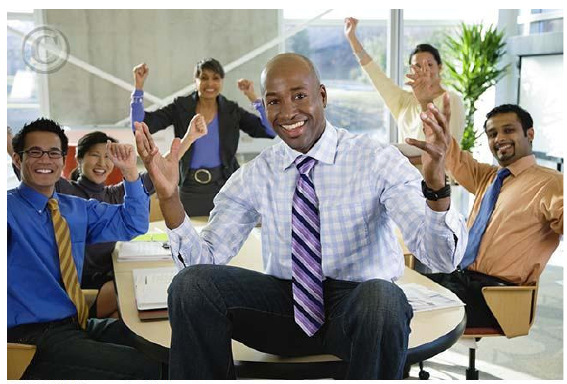
BLD062578 [RF]