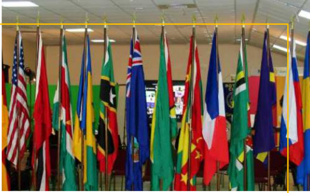
District 7030 All Present