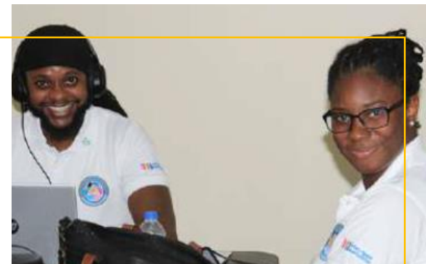
Behind the Scenes Magic