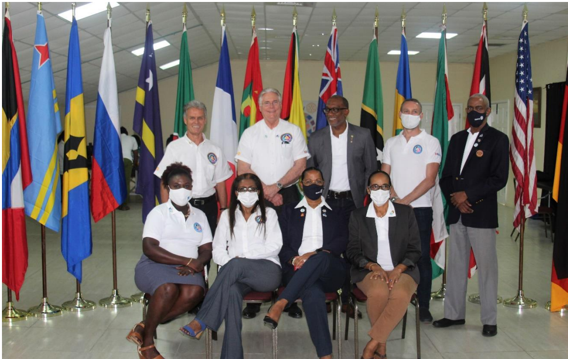
Rotarians at Conference Central - Saint Lucia

As Rotary faces its greatest challenge since its inception, growing from one man and one idea in 1905, to the formation of the 2000 th club four years later, and by 1936 to the inauguration of 4000 clubs, its impact is unquestionable. Rotary is the first NGO with significant impact on world events. The full spectrum of human rights has been impacted. Rotary has worked alongside UNESCO, the United Nations, the CDC and the Gates Foundation. This District Conference ended on a high note, charging Rotarians across the region and in the world, to “ serve to change lives. ”