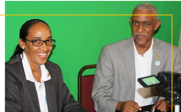
Ceremony Masters in the Green Room