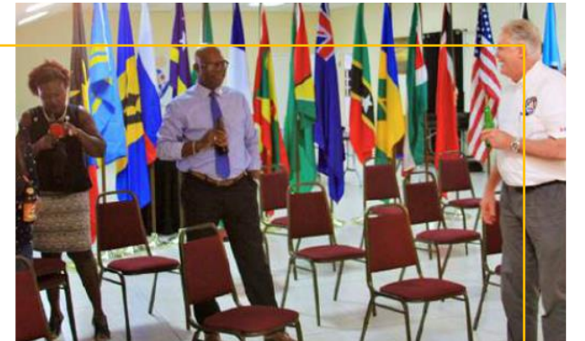
Safe Distance Fellowship