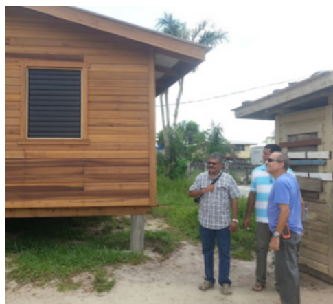
Extension of Kuru Kururu School

2016 - 2017 Theme: Rotary Serving Humanity