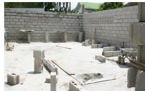
Sanitary Block at Archer's Home