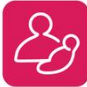
Maternal and Child Health