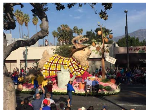
“Planting the Seeds of Service” Rotary’s 2018 Rose Bowl Parade Float