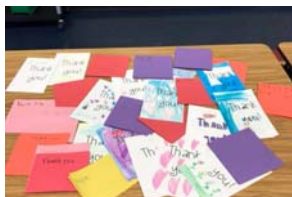
Cards received by W. Wichita Rotary Club

"Thank you so much for helping to provide a great and memorable Christmas for (my children). They are very special little girls that have been through so much and deserve to have this joy. Thank you, thank you, thank you from the bottom of our hearts."