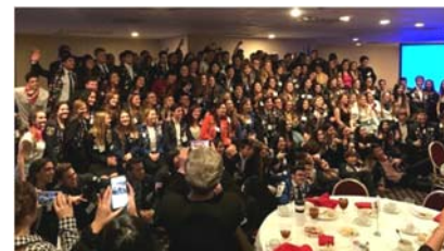
165 students from 37 Different Countries attended the SCRYE Winter Lock-In