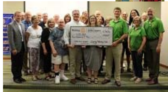
Article courtesy of PDG Robert Mendoza