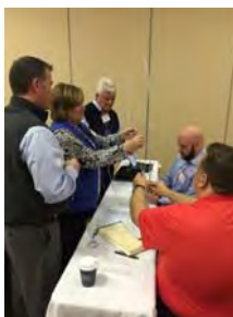
Fun & Team Building at PETS

pleasure to hear from our own District leadership discussing the value of Youth Exchange, RYLA and District Grants. Our District Rotarians cheered, laughed and together worked hard to develop a strong foundation for success in the next Rotary year.