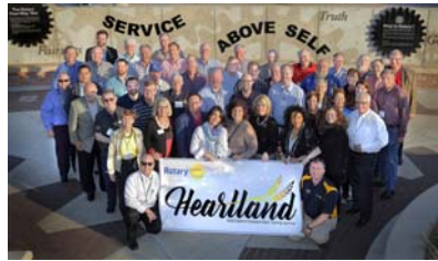
Our bus ride to Fellowship at Aero Planes Brewing included a stop at Rotary Plaza