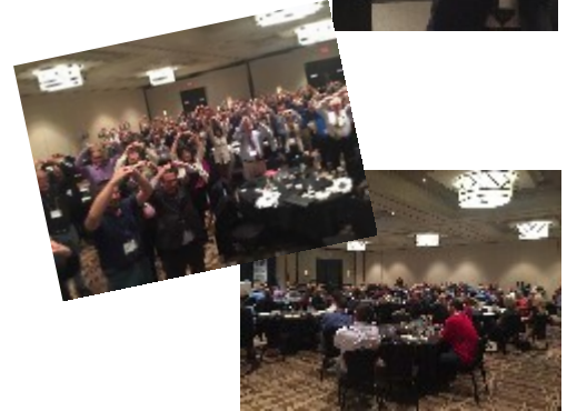
Rotarians from three districts in Kansas enjoyed great fellowship and gave themselves and our speakers an OVATION!