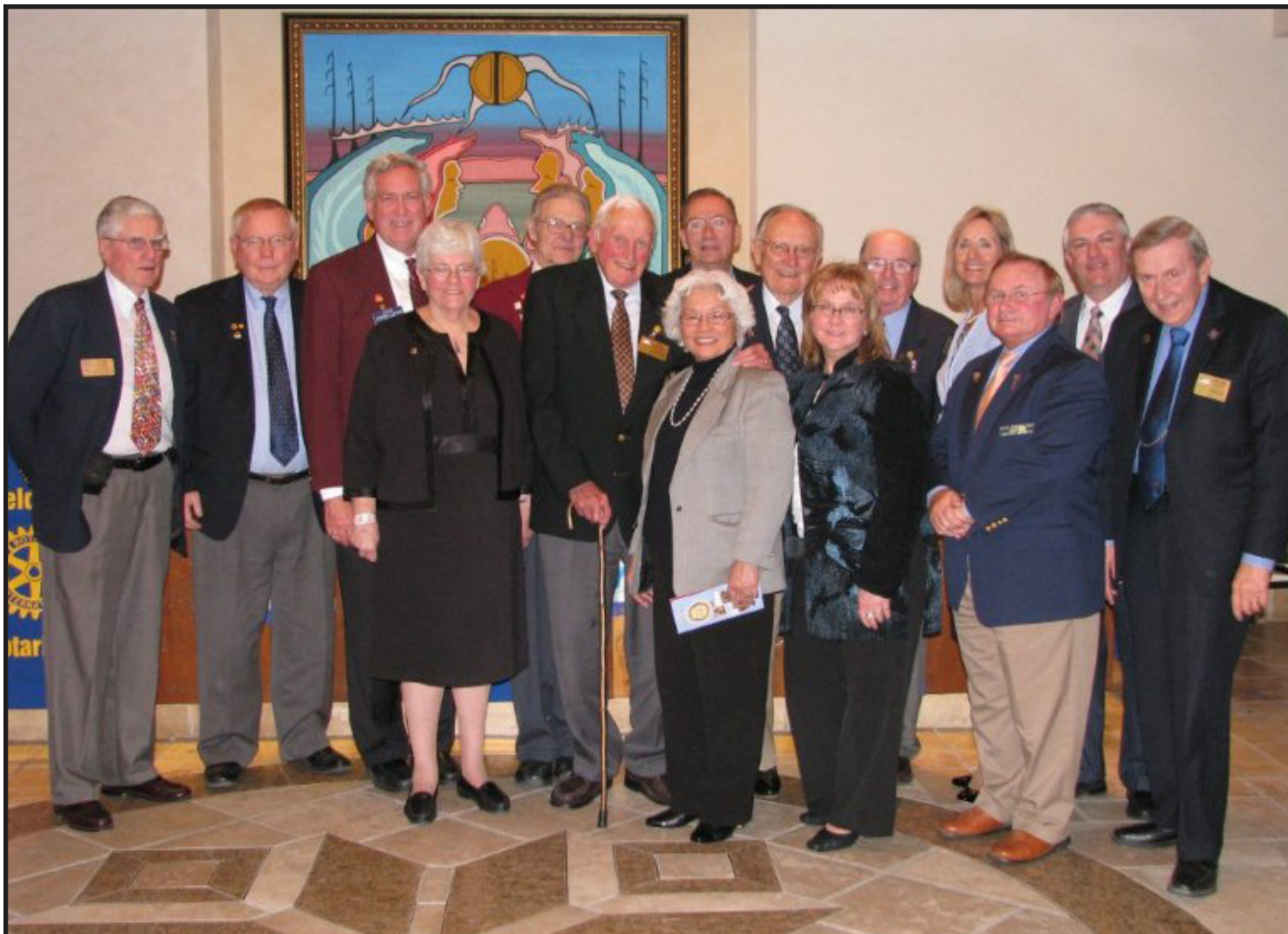
Past District Governors at dinner the evening before the 2011 District Conference.