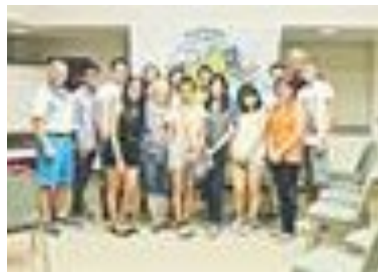
(The editor apologizes for the quality of the above photo.)

Thanks to the hosting clubs: Bay City, Cass City, Caro, Chesaning, Corunna, Frankenmuth Morning, Midland Morning, Midland Noon, and Owosso.