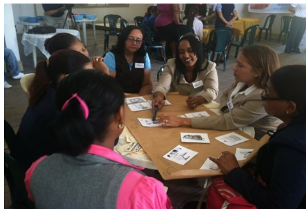
Teacher hand washing and hygiene training

We had the opportunity to see the outstanding work that has been accomplished by the projects our district has undertaken in water and sanitation. Likewise, we had opportunity to see the magnitude of the work yet to be done. One of the highlights of the experience was the time we spent observing teacher training for the Hand Washing and Hygiene Project 2 being implemented near San Francisco.