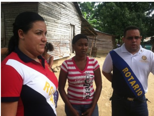
Planning for the village project

In November of 2013, I had the privilege of joining a group of Rotarians from District 6310 on a trip to the Dominican Republic related to our Water and Sanitation projects there. Some of my fellow team members on this trip have already shared their impressions with you and I can sincerely echo everything that they have said.