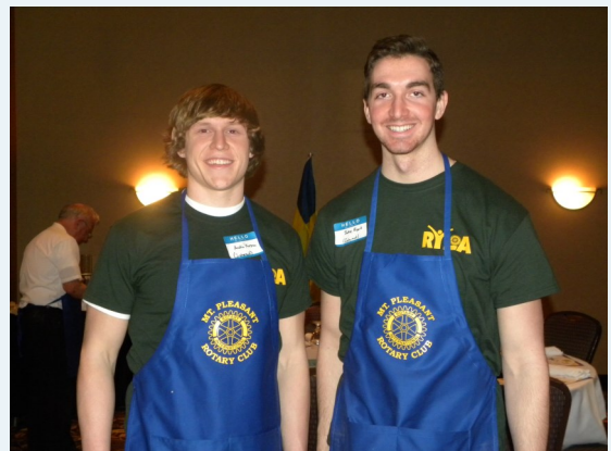
Local Mount Pleasant High School Interact members