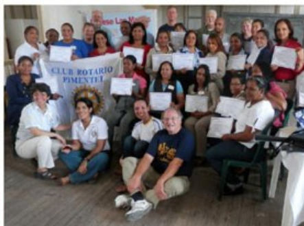
New certified hand washing trainers with District 6310 Rotarians