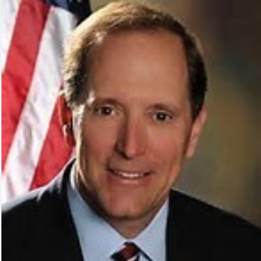
Congressman Dave Camp

Congressman Dave Camp spoke at the Midland Rotary Club on October 30 and gave an update on Washington DC. His focus as the Chairman of the House Ways and Means committee has been and will be until the end of his term on tax reform. The US has slipped over the past 30 years from having one of the best tax structures in the developed world to one of the worst. The Congressman highlighted that just getting the dynamic scoring of tax legislation in place is a significant accomplishment.