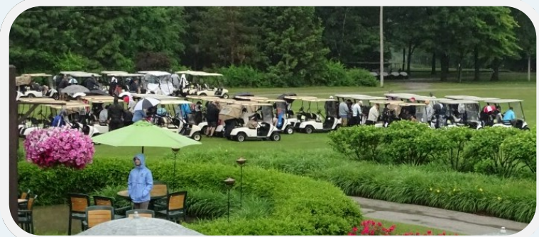
Carts lined up for a shotgun start

The Rotary Club of Bay City held its annual golf outing at the Maple Leaf Golf Course in Linwood on June 16th. For a week the sky had been beautiful and the temperatures just right. Then, the week of the outing, the forecast was for rain on the day of the event. Thursday morning dawned on a rainy sky and cool temperatures.