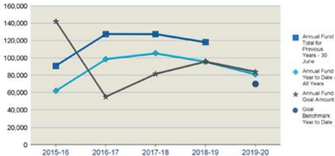
Annual Fund Measures

Year to Date (YTD) covers the period from July through April.