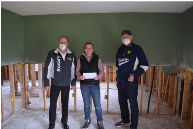
Photo of one of the five families who each benefited from a $ 1,000 gift certificates made possible by our donation.

The complete wording of the policy is too long to set forth here, but it provides that: "the greater sum of $1000 or 2% of the budgeted expenses spent on Club projects shall be placed into the NDF annually and invested separately." (Feel free to contact me if you would like to have the full wording of this fund policy) Over the years, this fund has been used to help with the tsunami in Southeast Asia, flooding in Newfoundland and on the Mississippi in the U.S., and the earthquake in Haiti.