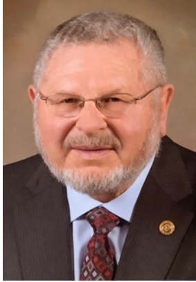
Morris Haugg Rotary Club of Amherst

In January 1998, when an ice storm knocked out electrical power in many areas of Quebec, our club sent $5000 to the Rotary Club of Granby to use at their discretion. They mostly used the money to buy generators for families in the greatest need. Our club realized that in the future we might not always have surplus funds to help in the case of a disaster. This resulted in the establishment of a "Disaster Fund" within our financial plan.