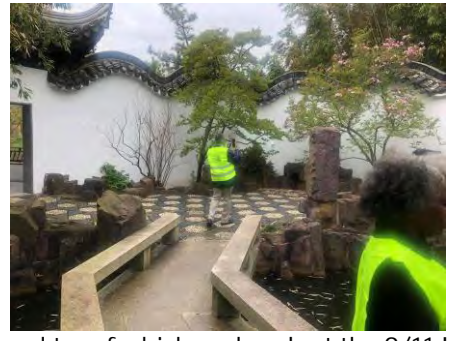
About 40 Rotarians, Rotaractors, and friends gathered to refurbish and replant the 9/11 Healing