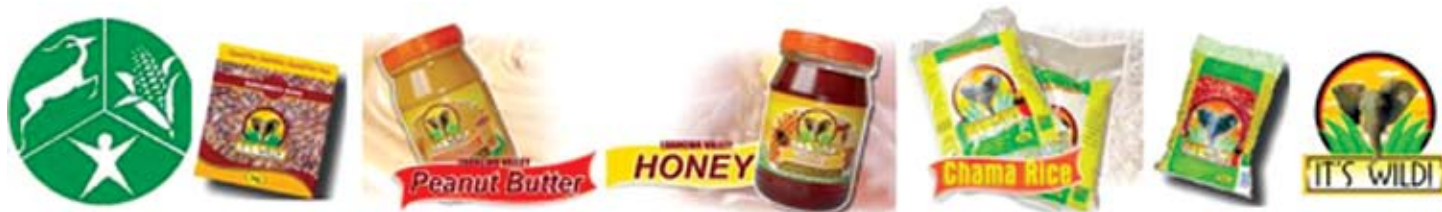
Some of The COMACO products.

Motivated by social and environmental goals, COMACO is a non-profit business that manufactures processed food products such as rice, peanut butter, and honey sold under the brand, It's Wild!. These products originate from farmers in the Luangwa Valley of Zambia whose yields were once insufficient to meet family needs but, with help from COMACO in the form of training, inputs and market incentives, are now producing a surplus. Today, over 40,000 farming families are registered members of COMACO producer groups. Driving this transformation is a business that promotes sustainable farming techniques thereby removing the need to poach or destroy renewable resources to meet family needs. Funds raised in 2010 enabled the Bronxville Rotary Foundation to complete a $65,000 Rotary International matching grant which delivered 1,500 beehives and other beekeeping equipment to farmers. A portion of last year's and this year's funds will support a second beekeeping matching grant for farmers in another area of the Luangwa Valley.