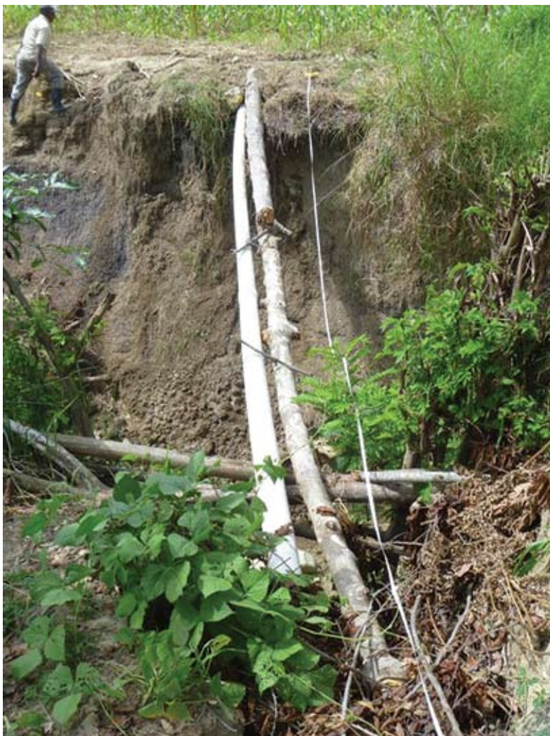
Construction of the aqueduct for the Sabana de la Loma community in the Dominican Republic.

Los Paredones, one of the poorest communities in the region, with 70 residents. It has never had a water system and needs an electric or solar-powered pump system. Currently the residents walk about half a mile to obtain water from irrigation canals that are contaminated.