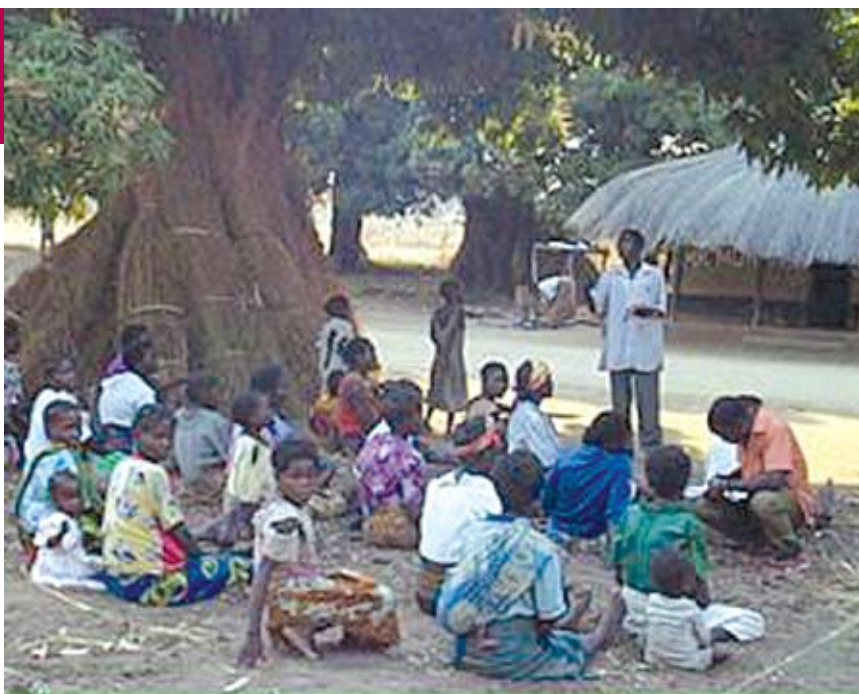
Female lead farmers at Field Days.