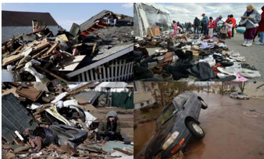
Chilling photographs of some of the damages sustained on Staten Island.

Rotarians have indicated that when it comes to donations of food and clothing, the situation is good. The urgent need is for cash donations or especially gift cards to such stores as Target, Wal-Mart, Home Depot, Lowe's and ShopRite and other grocery stores. Money is probably most needed so that people can start rebuilding.