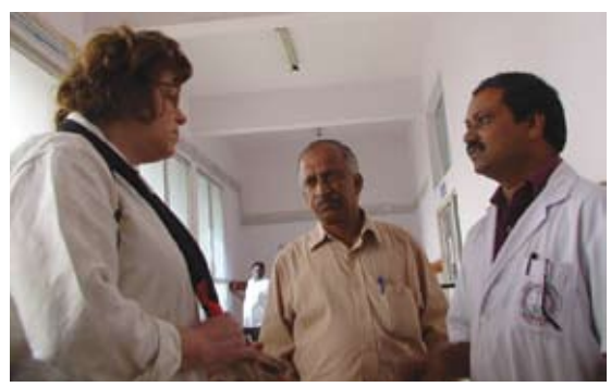
At RajaRajeshwari Hospital