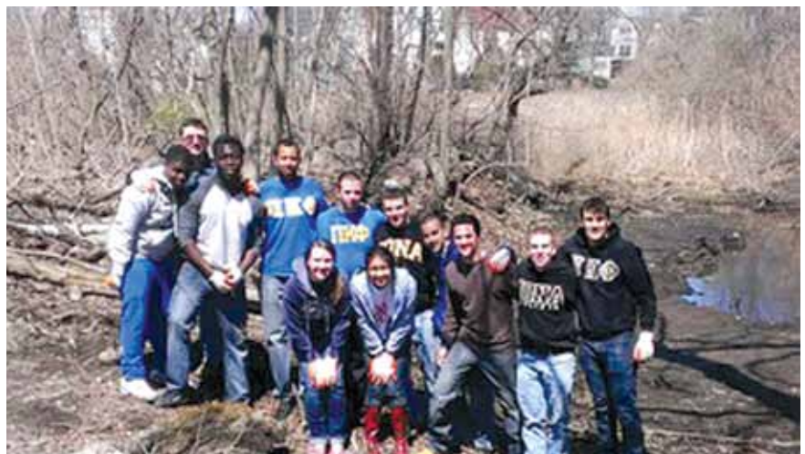
Rotarians from Larchmont and New Rochelle cleaned up the Premium Point Marsh with help from the Pi Kappa Phi fraternity (middle picture).