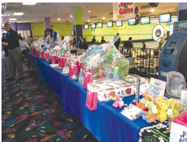
The impressive display of raffle and auction prizes.