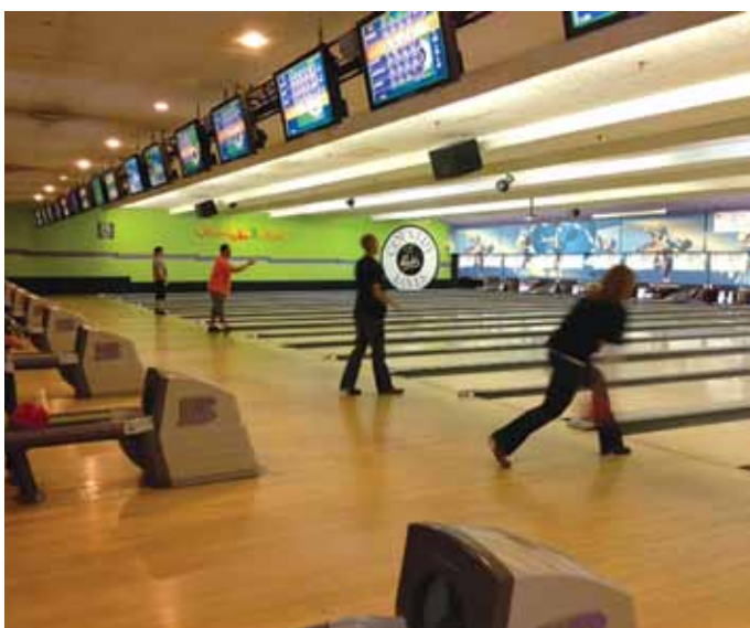
Let the games begin!