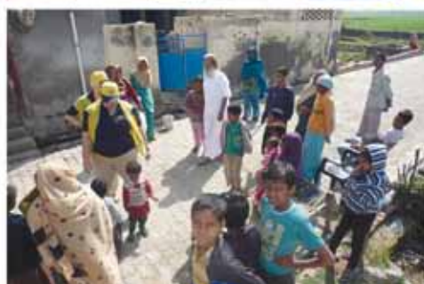
Photos from the door to door vaccination mission in Sonepat, one hour outside of New Delhi.